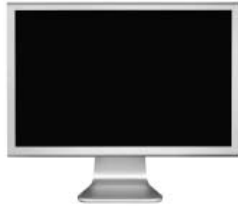
Full HD Monitor 1920x1080p