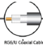
RG6/U Coaxial Cable