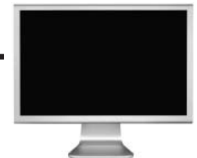
Full HD Monitor 1920x1080p