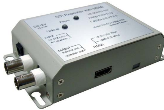
SDI-Converter-Repeater HDMI Model: SDI-COV-R260-RTH